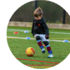
ALL ABILITIES WELCOME