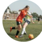
ALL YEAR TRAINING

Group sessions built around our proven coaching method, designed to help every player improve - whatever their level.