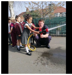
Fire Truck visit