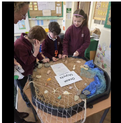
As part of Science in Year 2, the children enjoyed a carousel of ocean themed investigative activities.