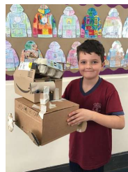
Year 5 have been very busy making Mars Rover models as part of our British Science Week competition on 'Curiosity'.