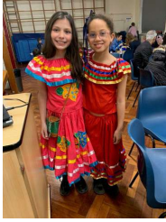
PTA Culture Night