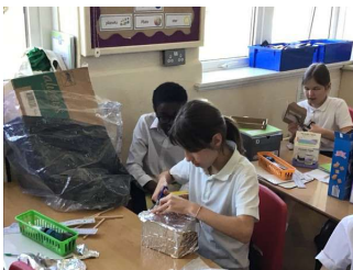
Year 5 have been very busy making Mars Rover models as part of our British Science Week competition on 'Curiosity'.