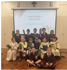
Year 3 Liturgy - Palm Sunday