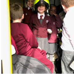
Fire Truck visit