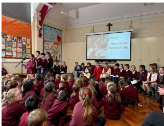
Year 4 Liturgy - The Last Supper