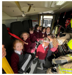
Fire Truck visit