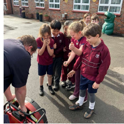
Fire Truck visit