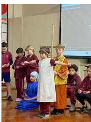
Year 5 Liturgy - The Crucifixion