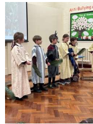
Year 3 Liturgy - Palm Sunday