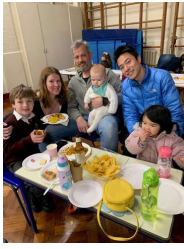
PTA Culture Night