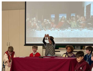
Year 4 Liturgy - The Last Supper