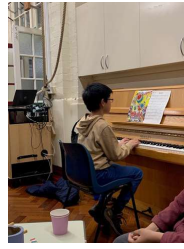
PTA Culture Night