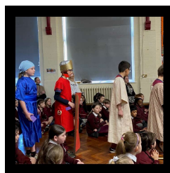
Year 5 Liturgy - The Crucifixion