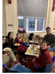
PTA Culture Night